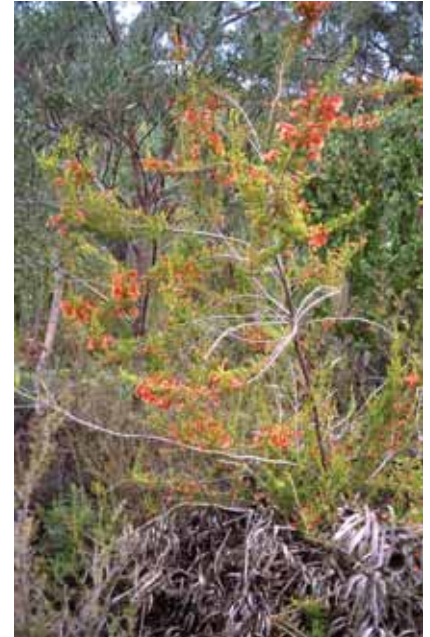
Bicoloured heath ( Erica discolor ): Pomonal, near the Grampians NP, Vic.

A planned, strategic approach is essential to ensure that after treatment, the weed is replaced by native plants rather than new seedlings, regrowth or other weeds. As well as the information presented in this guide on Erica species' biology and control methods, a plan needs to be based on specific knowledge about the site—including the distribution of other major weeds.