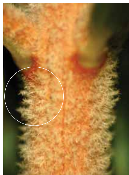
Tree heath ( Erica arborea). Branched hairs on the branchlets can be seen with a hand lens.