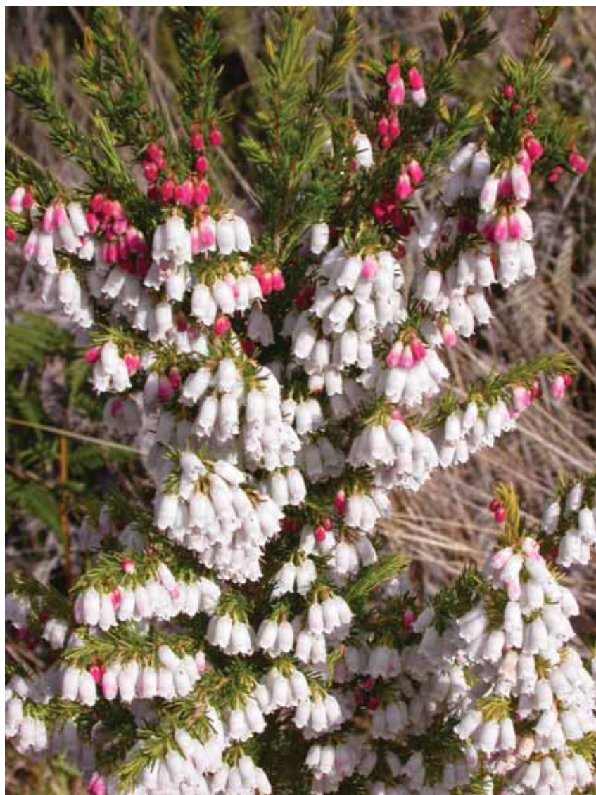
Spanish heath ( Erica lusitanica ) flowers are numerous and pink-tinged in bud.

More than 12 species of Erica have been recorded as naturalised in Australia. All are shrubs, with narrow leaves that are opposite or in whorls of 3 or 4. Flowers are bell-shaped, tubular or globular with 4 lobes. Fruits are capsules containing numerous small seeds. The main features of the most common species in Australia are summarised in the table on the next page.