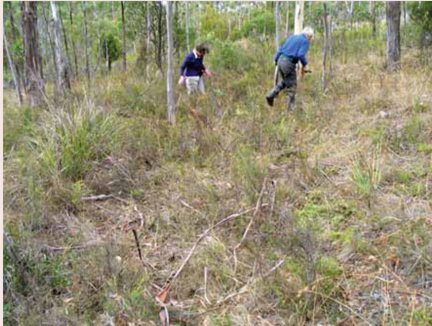
Hand removal of Spanish heath ( Erica lusitanica ): Wellington Park, Tasmania.

Patches of mature Spanish heath in native vegetation have been cut and swabbed using glyphosate. Other weeds have been dealt with at the