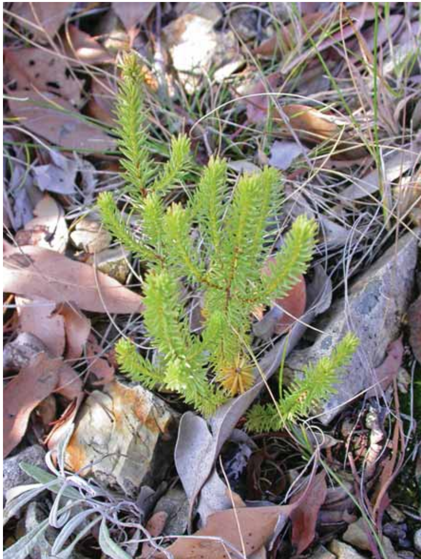
Seedlings may be hand pulled. Berry heath ( Erica baccans ) seedling: Tasmania.

In selecting the most suitable control techniques it is essential to minimise adverse impacts on native vegetation and to encourage its subsequent recovery. Whichever methods are used, it is important to manage plant material that may be carrying seeds to prevent dispersal.