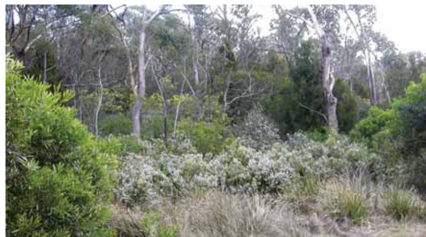
Spanish heath ( Erica lusitanica ) invading native vegetation: Tasmania.

This map highlights 3 Erica species listed above. Other species such as E. arborea , E. quadrangularis , E. scoparia and E. discolor occur within this range.