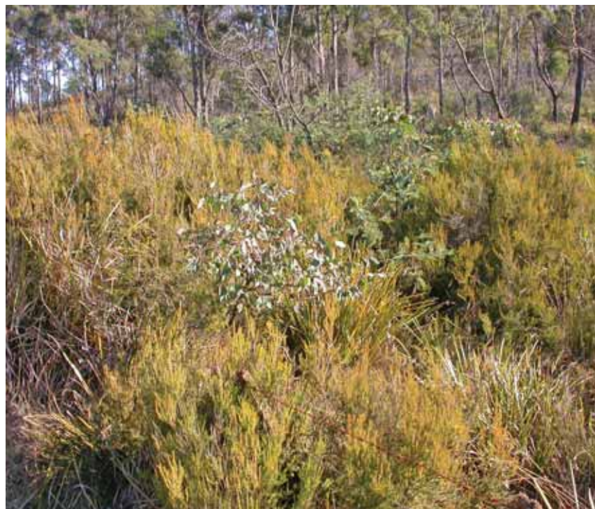
Besom heath ( Erica scoparia ) spreading from roadsides into bushland: northern Tasmania.