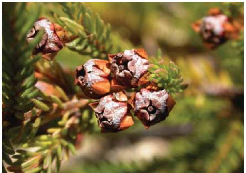
Ericas have dry seed capsules: berry heath ( Erica baccans ), Tasmania. Photo: Matthew Baker, Tasmanian Herbarium

Disturbed, open situations such as roadsides and edges of bushland provide favourable conditions for establishment and the weeds spread from there into the bush. Depending on the species,