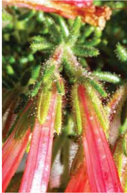
Erica glandulosa has glandular hairs on young stems, leaves and the sepals at the base of the flowers. Mount Lofty Ranges, SA.