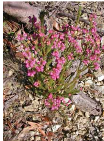
Berry heath ( Erica baccans): Tasmania.