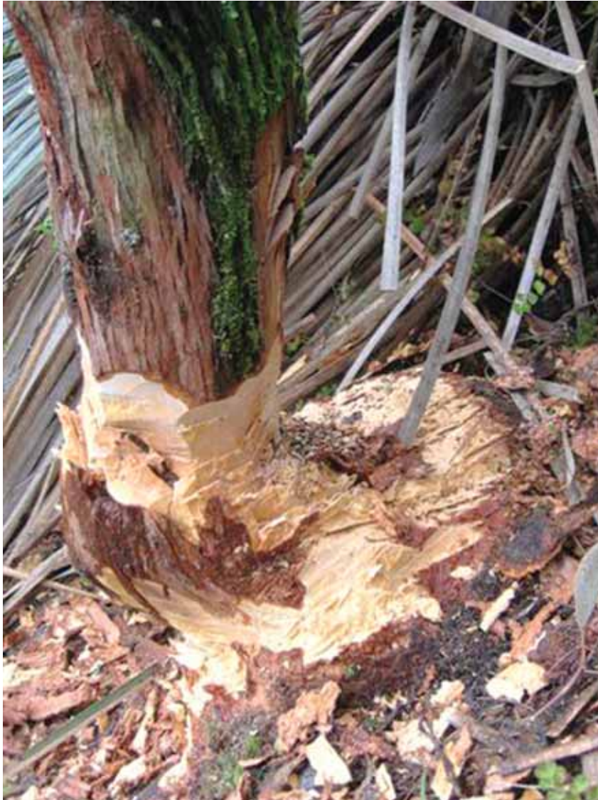
Large tree heath ( Erica arborea) trunk and lignotuber frilled and ready for swabbing: SA.